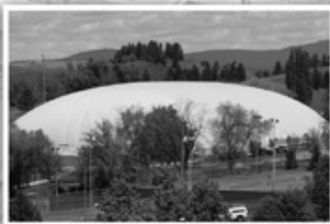
Indoor Practice Facility