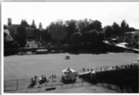
Lower Soccer Field