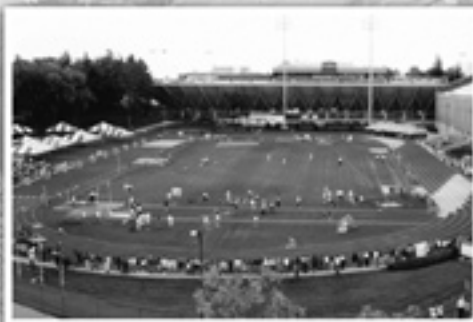
Mooberry Track & Field Complex