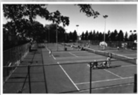
Stadium Way Tennis Center